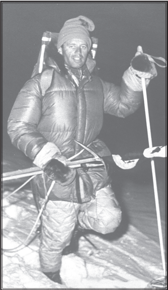
HE DID IT! Bobby Kennedy strides into camp after climbing Mount Kennedy.