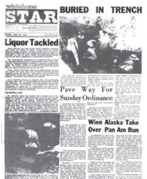
SEE CENTRE PAGES FOR CITY'S ANNUAL STATEMENT

From The Whitehorse Star, Thursday, April 12, 1962